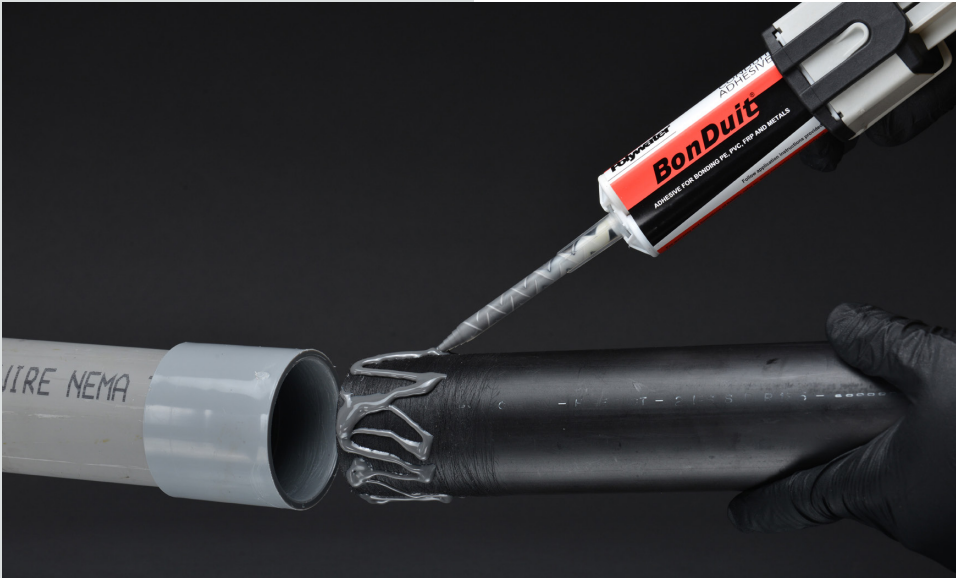
Joining HDPE to PVC conduit

Strong, Watertight, and Airtight Adhesive for HDPE Conduit