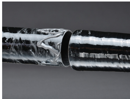
Fiberglass pipe connection

BonDuit® Conduit Adhesive creates a watertight and airtight conduit connection within an hour after application. The strong bond withstands movement and vibration, ideal for installation along roadsides or near electrical equipment such as transformers or switchgear.