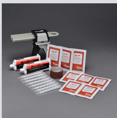
Catalog # BT-KITG