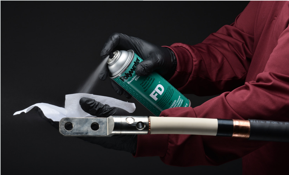
Spraying onto a Polywater lint-free towel

Fast-Drying Cleaner for General Electrical and Industrial Use