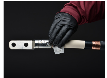
Polywater® DT-69 lint-free towelette