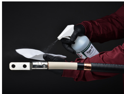
Refillable spray bottles

FD™ Electrical Contact Cleaner is a fast-drying, multipurpose cleaner. FD cleans everything from bus bar to splices and terminations. Approved by medium and high voltage cable manufacturers. FD removes semicon residue, adhesive, silicone grease, anti-oxidants, and contaminants. FD leaves no residue.